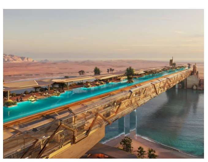
Trayam, NEOM (render)

For more information contact: f.begaj@mondiale.co.uk