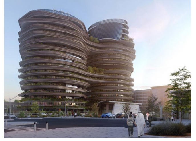
SIRO Olaya Riyadh (render)