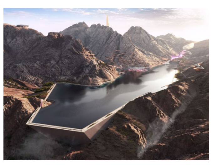
Trojena, NEOM (render)